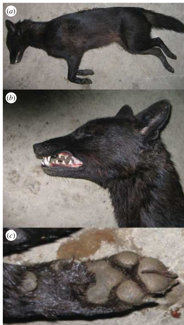
Figure 3. Male golden jackal–dog hybrid (60c) with black coat coloration (a) and ears with rounded tip (b) (dog characteristics), and forelimbs with partially joined digital pads of the middle fingers (golden jackal characteristics) (c).