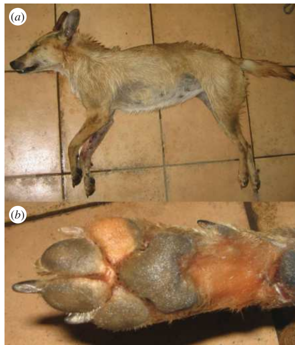
Figure 1. Female golden jackal–dog hybrid (S21) (a) and its forelimb with notable digital pad depigmentation (dog characteristic) and partially joined digital pads of the middle fingers (golden jackal characteristic) (b).