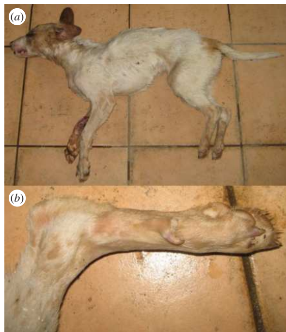
Figure 2. Male golden jackal–dog hybrid (S22) (a) and its hind leg with dewclaw (b).

table S2). The average number of alleles ( N_a ) and private alleles ( N_p ), and the observed and expected heterozygosity ( H_o , H_e ) were estimated using GENALEX v. 6.5 [32,33] as measures of genetic diversity. Exact tests for Hardy–Weinberg equilibrium were computed using the Guo and Thompsons' Markov chain method [34] as implemented in the software GENPOP v. 4.00 [35]. The sequential Bonferroni correction test for multiple comparisons was used to adjust significance levels [36]. The 15-STR multilocus genotypes of the reference jackals and dogs, and of the three putative hybrids were used to distinguish species and to detect putative admixed individuals and their ancestry through two